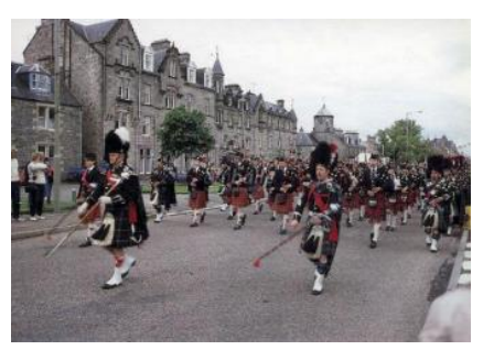
Friday 8 August Free day for Self-Guided Tours

Evening: Clan Grant International Gathering 2025 Community engagement event: Beating Retreat & Music - The Square, Grantown on Spey