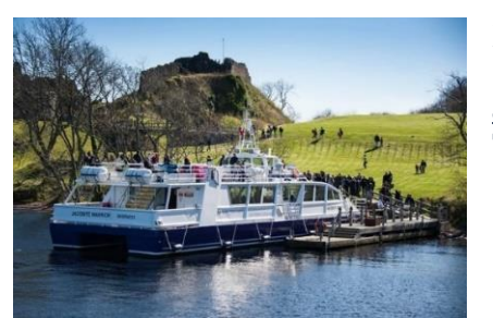
Monday 4 August Day: Visit to Urquhart Castle via Jacobite Cruise

This is the second most visited site in Scotland and a very important Grant stronghold.